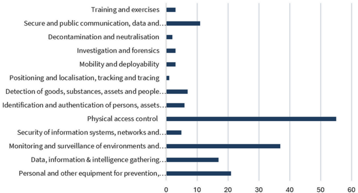
Figure 4 - Mapping of the SICUR conferences in the Functions domain, according to the EU Security Market taxonomy.