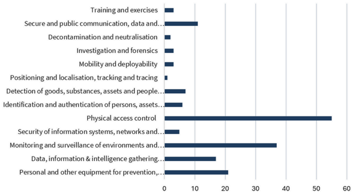
Figure 1 – Mapping of the exhibiting private companies in the Functions domain, according to the EU Security Market taxonomy.